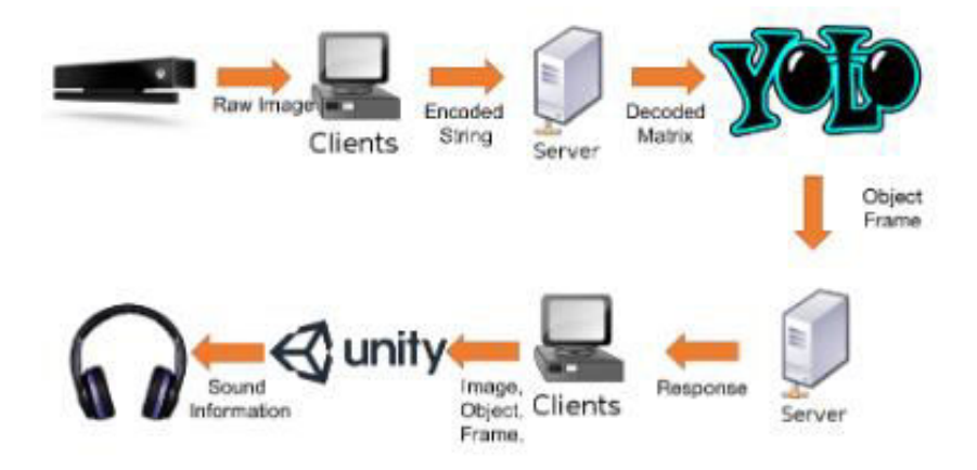
Figure 2: Data Flow Pipeline for visually impaired[Rui (Forest) Jiang Earth Science, Stanford, Qian Lin Applied Physics, Stanford Let Blind People See: Real-Time Visual Recognition with Results Converted to 3D Audio]